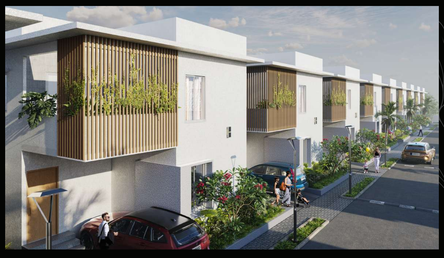
Disclaimer. The images shown in this brochure are for representation purposes only. The actual project may vary in appearance & design. These visuals are intended to provide a general idea and should not be considered exact depictions of the final development.